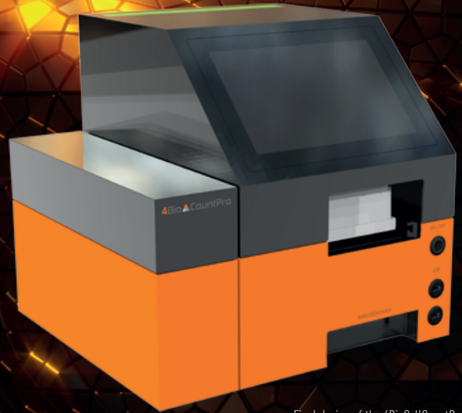
Final design of the 4BioCellCountPro